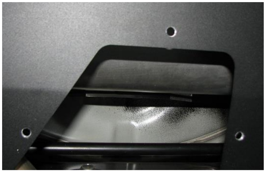
Figure 6.2: Drilled holes