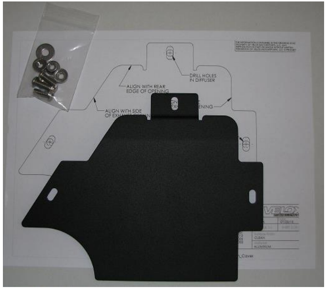
Figure 5.1: Assembly Parts