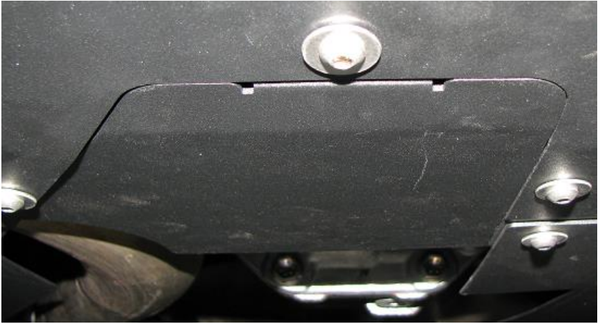
Figure 6.3: Finished