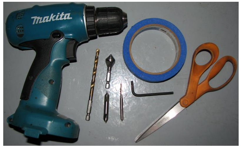
Figure 4.1: Tools Needed