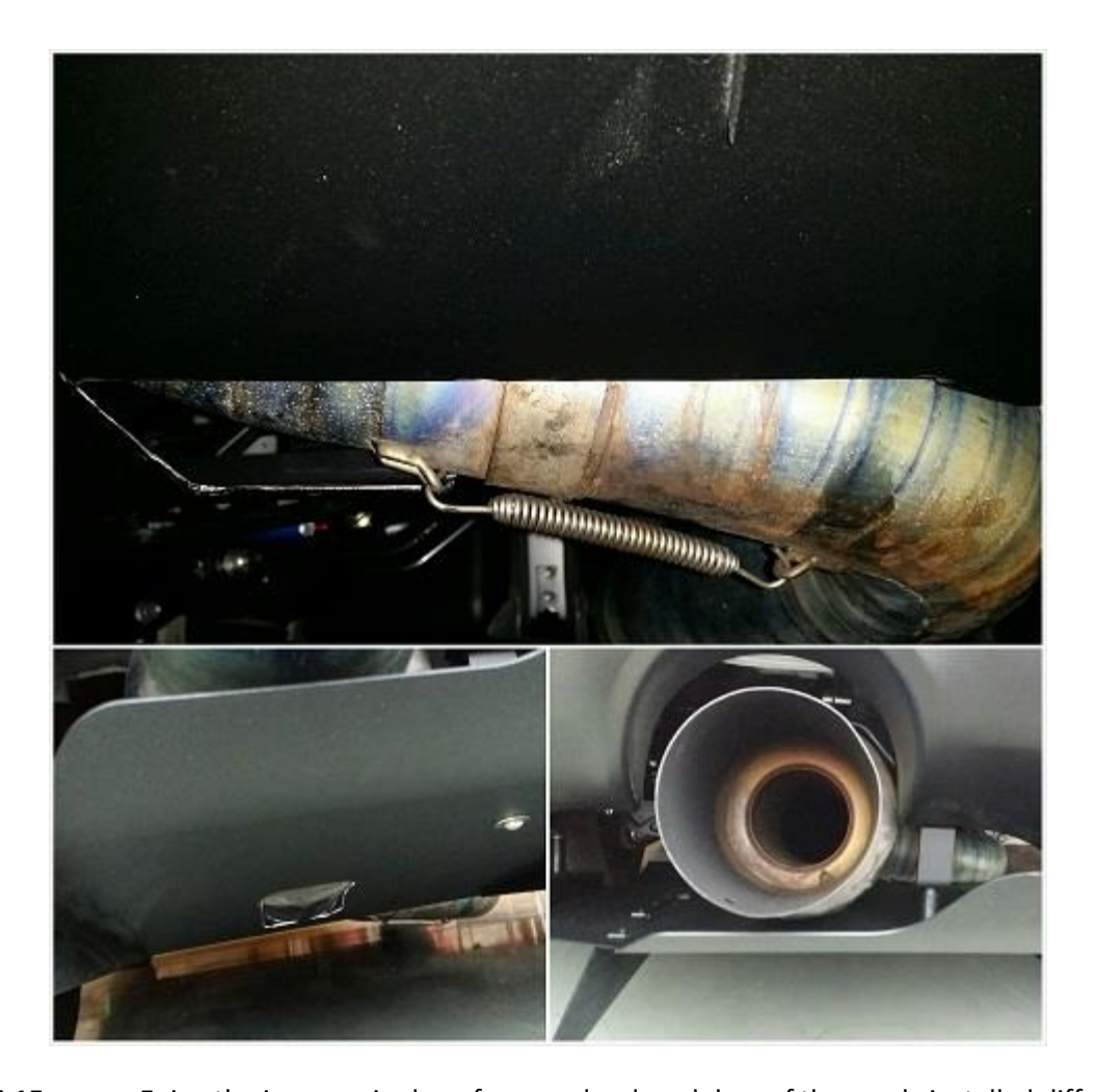
6.15. Enjoy the increase in downforce and reduced drag of the newly installed diffuser.