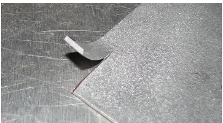
6.10. Using the 90 degree angle grinder and sheet metal finisher, clean up the cuts so that the edges are nicely finished.